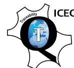
Raw Material Traceability ICEC TS-SC410 ICEC TS-PC412