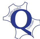
Process Certification LEATHER 40075 CERT-001-2007-PCS-ICEC

"RECUPERIAMO LE NOSTRE PELLI DALLA FILIERA ALIMENTARE"